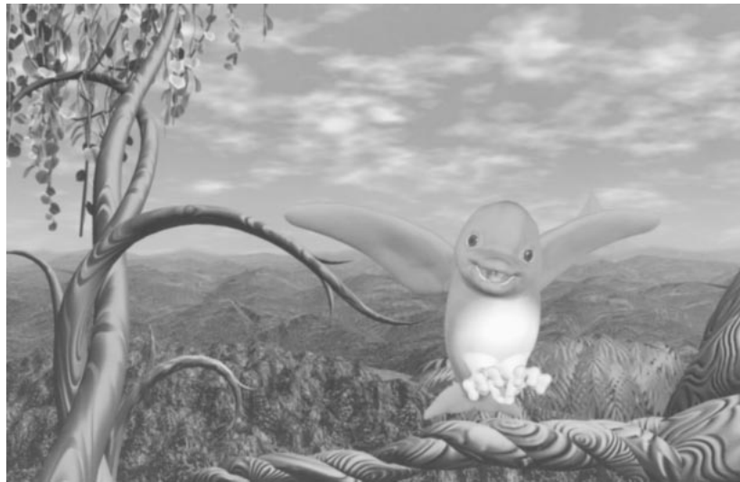
Figure 2 “TEO – Another Earth.”

CG Sapporo in 1990. The presentation contained a shark and three jellyfish. The shark chased the jellyfish when it was hungry, and the jellyfish gathered together to play with human visitors to their world. Wearing data gloves, people could have a type of conversation with the artificial organisms through gestures. In 1992, based on our first attempts, we developed another world of artificial life named “Charlotte,” in which 10 artificial organisms lived. These artificial organisms had the autonomy mechanism described above, which made them behave with an individuality. Some of them had friendly relations with each other while some of them struggled with each other, and they formed groups similar to the groups that are formed in a society of monkeys.